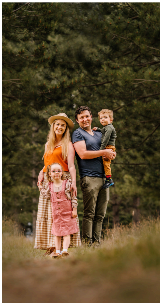
PHOTO SHOOT Colour palette